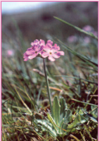
Bird's Eye Primrose

This small, pink-flowered primrose, to 15cm tall, grows in damp, lime-rich areas in Northern England. The petals fade to a bluish colour and seed-heads are found at the top of the leafless stalk after the flowering period.