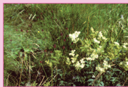
Meadowsweet and Greater Burnet

(July–September) A tall plant of damp places, the flowers are fragrant, small and cream in dense, many-flowered heads at the stem tops. It was used to flavour mead and as a strewing herb at weddings.