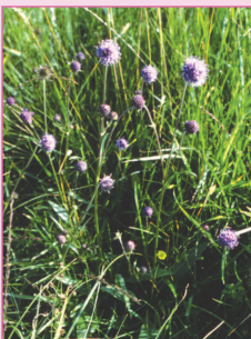
Devil's Bit Scabious

this medium-tall plant stand out amongst the other meadow species. 'Devil's Bit' refers to the apparently bitten-off end of the short rootstock—not a feature you can see!