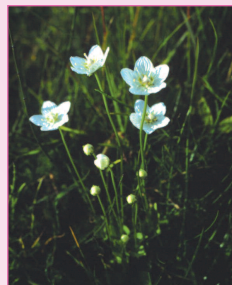
Grass of Parnassus

(July–September) In the damper meadows, a few loose dandelion-like heads on a tall leafy stalk may well be this species – but beware, there are many 'dandelion-like' flowers! It keeps good company with Globe Flower and Wood Cranesbill.