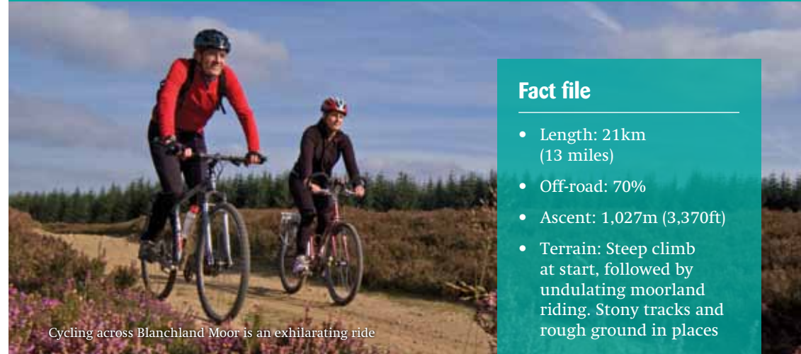
Cycling across Blanchland Moor is an exhilarating ride

This stunning ride starts at Baybridge, close to the village of Blanchland. You'll follow the Carriers' Way across Bulbeck Common, alive with the evocative calls of wading birds in the spring and early summer.