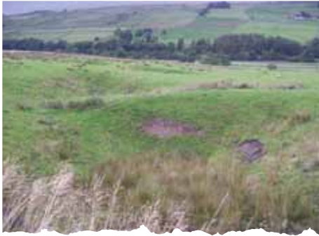
Shake holes are a quite common feature in the North Pennines