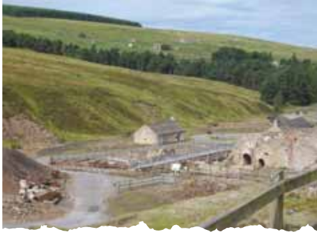
The old smelt mill at Nenthead Mines