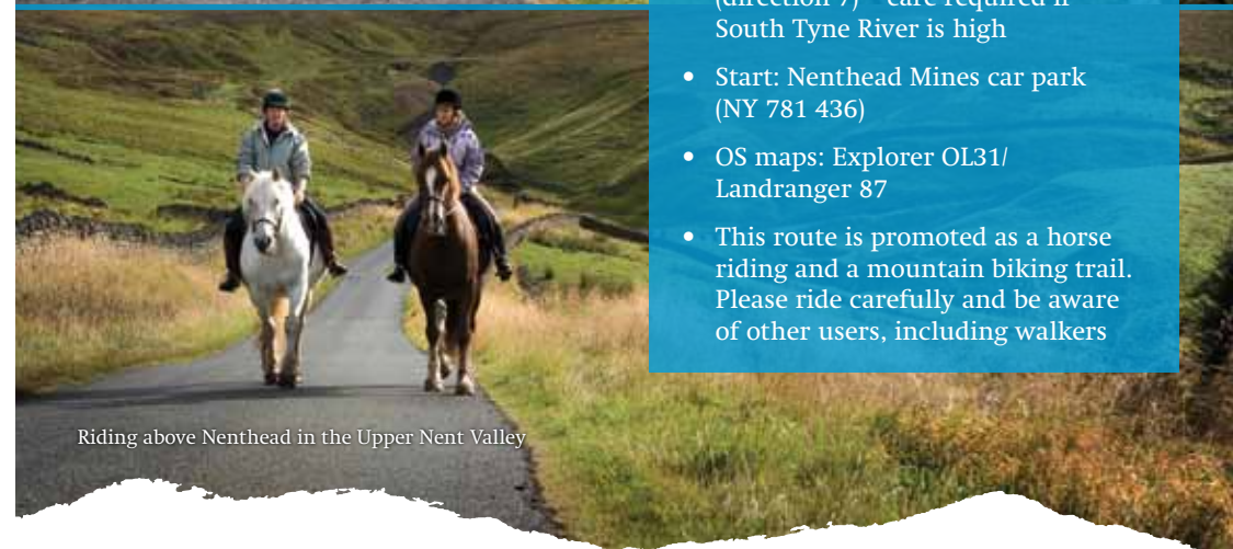
Riding above Nenthead in the Upper Nent Valley