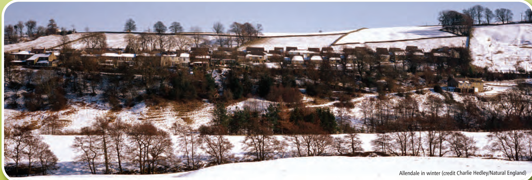
Allendale in winter

Turn left before the buildings at Hindley Wrae and follow the footpath along the valley edge past Asheybank and Harlowbank down to the River West Allen and Blueback Bridge. The Elk's Head sits at the junction with the main road and a short distance to the north along the road is the Whitfield Pantry,