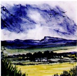
"Hadrians Wall Country" -by Judy Brown

7. At the junction, turn right to cross the bridge over the Haltwhistle Burn and continue up Castle Hill. Keeping left, follow the main road through the centre of Haltwhistle and on down to Haltwhistle Station.