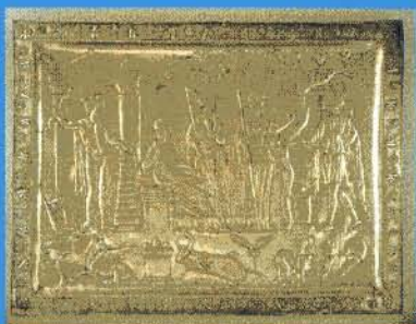
The Corbridge Lann

Another resident of the river that has seen a recent increase in its numbers is the elusive but attractive otter.