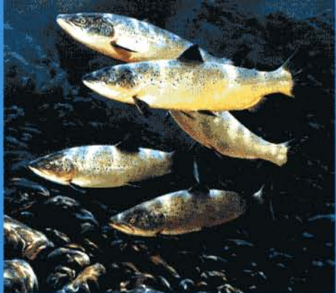
The Valley (Wine Salmon) - oil painting by Rod Sturtevant