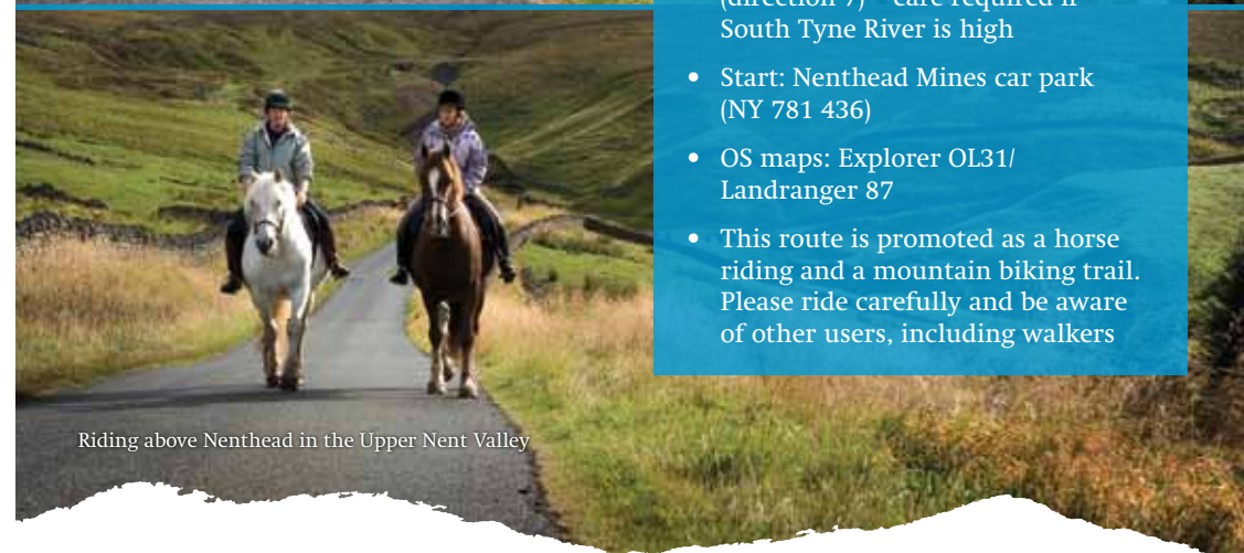
Riding above Nenthead in the Upper Nent Valley